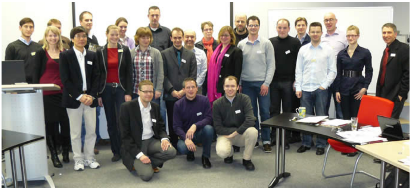
Participants on the Foto (from left to right)