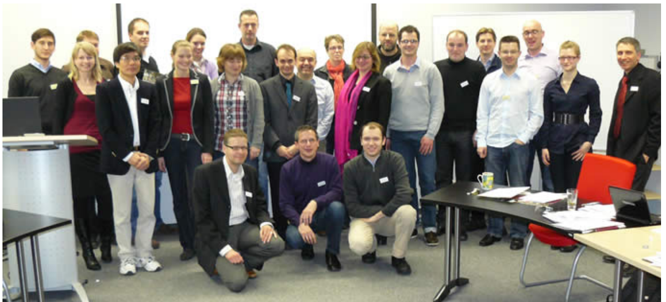
Participants on the Foto (from left to right)