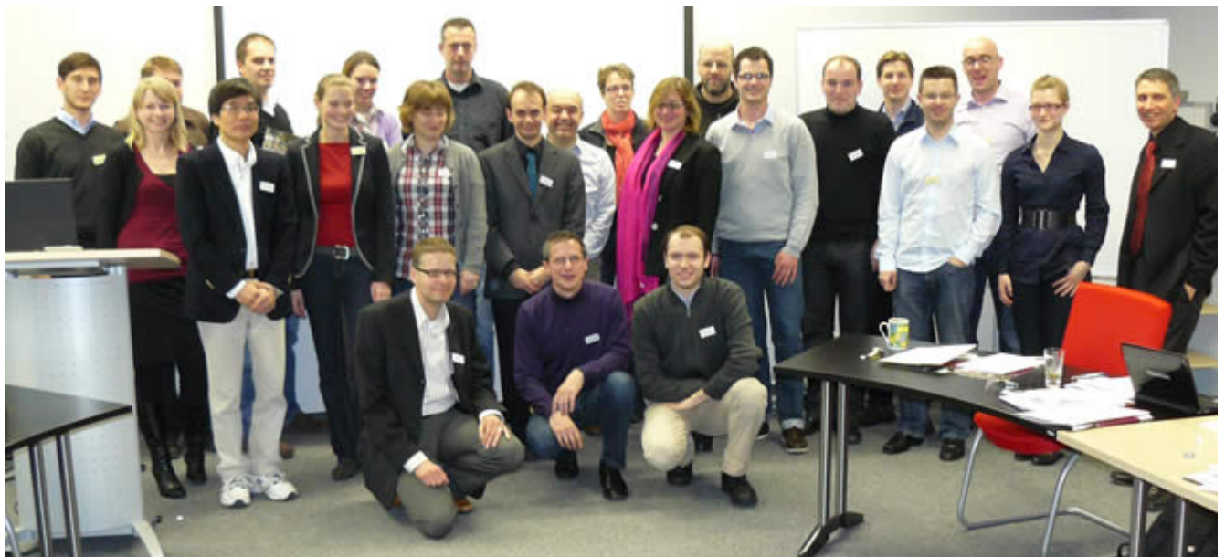
Participants on the Foto (from left to right)