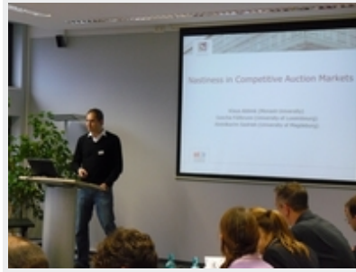
2012-01-13 Workshop 41