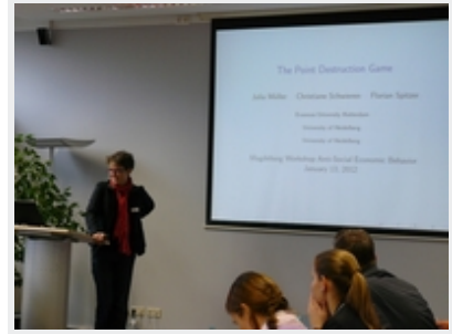
2012-01-13 Workshop 43