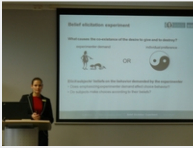
2012-01-13 Workshop 35